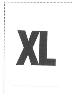
Etichetta taglia per sacchetto